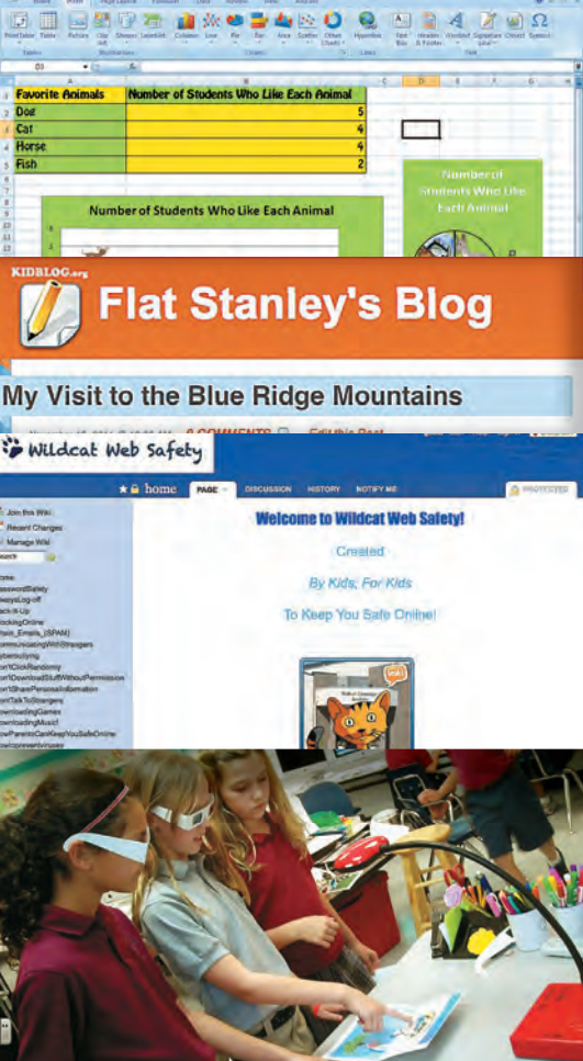
McKeel Elementary Academy students produce work for authentic audiences.

and ownership over their learning, as well as allow them to bring their observations into the subsequent lesson, discussion, or creation activity as prior knowledge.